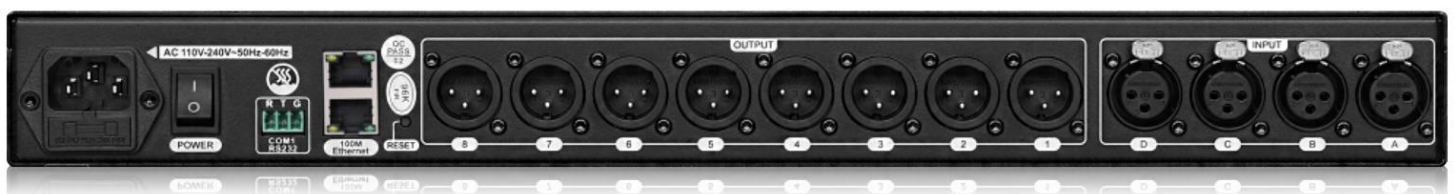
Rear view of the model PRO 96K (4 in - 8 out)

State-of-the-art professional digital processors with compact and lightweight design. High end performance thanks to the inclusion of First-class components, offering high efficiency and energy saving which reduces the operation cost.